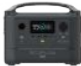
RIVER 600 MAX