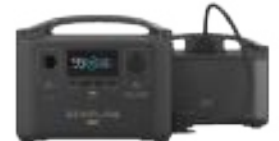
RIVER 600 PRO with Extra Battery