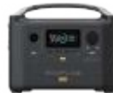
RIVER 600 PRO